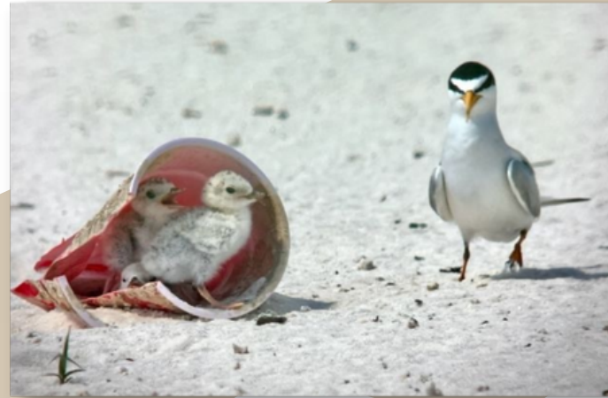
Least tern chicks seeking shade in a littered plastic cup.